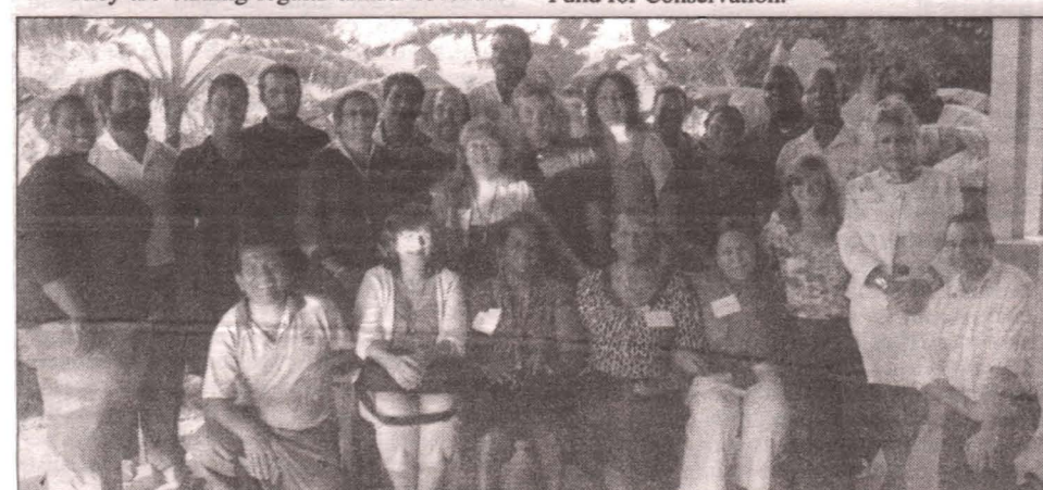
Participants who attended the Symposium in Grenada

The Grenada symposium was organized by Eastern Caribbean Coalition for Environmental Awareness, the Pew Environment Group, the Kido Foundation and the Grenada Fund for Conservation.